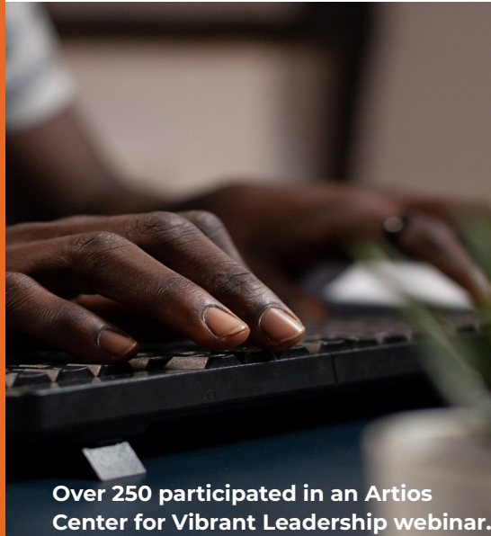
Over 250 participated in an Artios Center for Vibrant Leadership webinar.